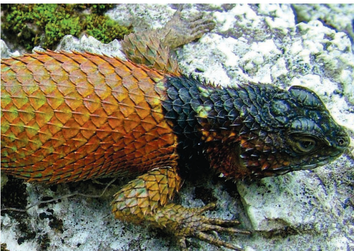
No escape from warming. The lizard Sceloporus serrifer has gone locally extinct at several warmed sites in México.

39% of all lizard populations and 20% of all lizard species will be extinct.