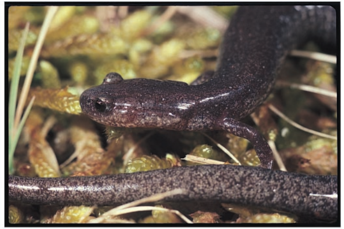
Fig. 2. P. cinereus and P. hoffmani .

there is a deterministic phenomenon to explain.